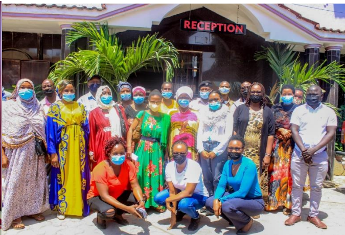
Empowering Children, Youth, Girls and Young Women!