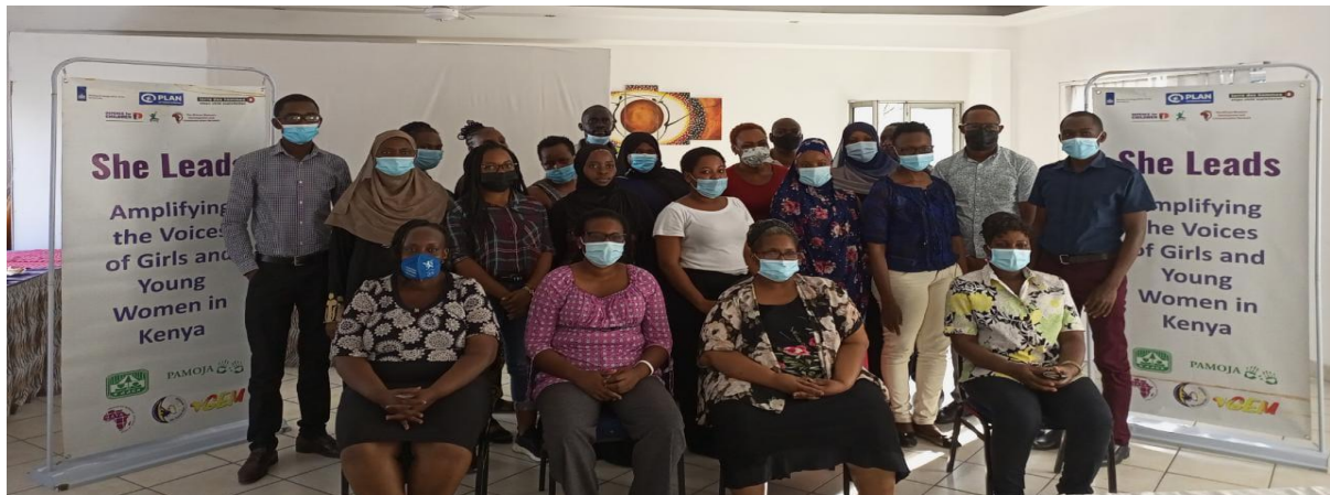
Community leadership session in collaboration with our partners in the SHE LEADS Program