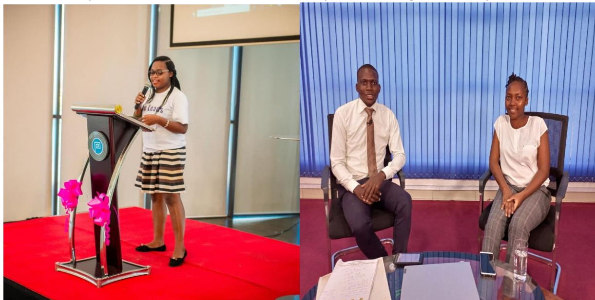
Youth and leadership (Team Leader and Project officer at different youth leadership forums

relation to child rights and youth empowerment. SCDO vowed to work together with the leaders to create a society whose GYW's are self-resilient and independent through mentorship.