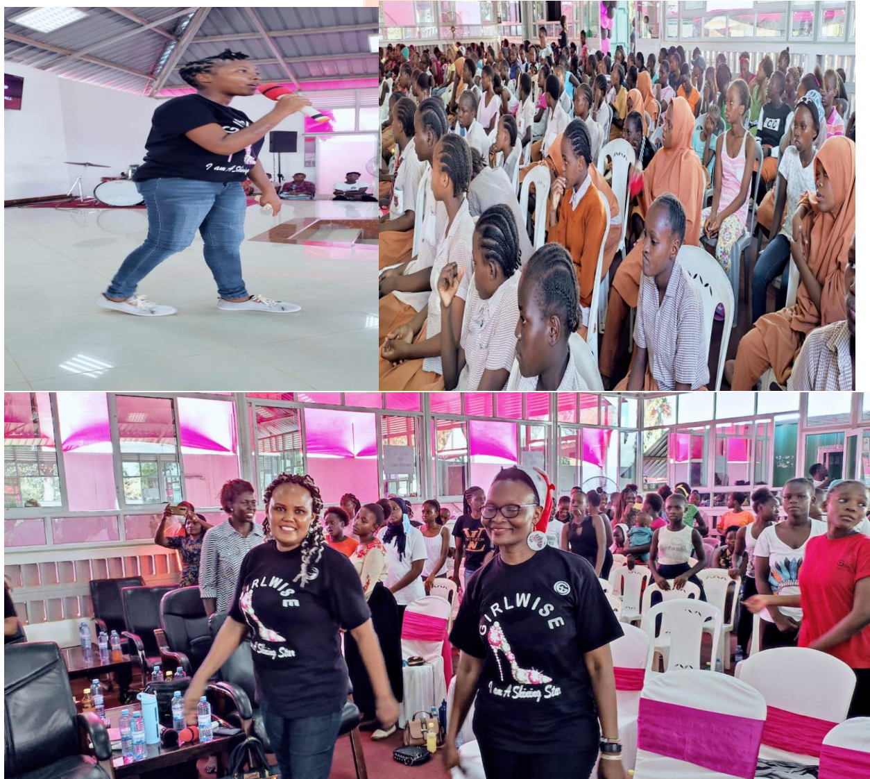
Participating in the Girl Wise event held by our local Church Glory Tabernacle Church

SCD in collaboration with the local church, supported 15 Girls and Young Women to attend Girls Movement called GIRLWISE, which is a charitable organization for women that seeks to empower girls to discover their beauty and purpose in life and mentorship. The event held on 22 nd December at Glory Tabernacle church, Nyali was a success with an audience of over 300 girls. The GYW's were privileged to participate in the event by performing a dance on the importance of a women-led society. After the event, each GYW received a gift pack courtesy of the movement and were encouraged to support the girl child empowerment through theatre and art.