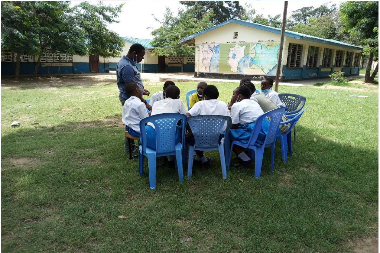
Children in Child Rights Clubs giving their views on policy matters and issues affecting them

Empowering Children, Youth, Girls and Young Women!